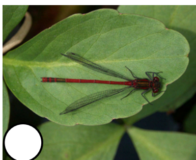
Large Red Damselfly